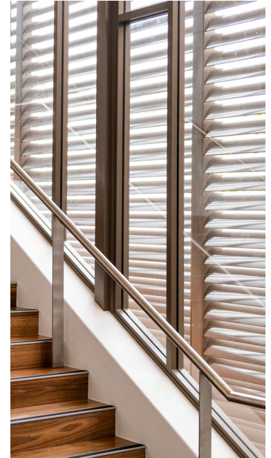
Design and Construction: O'Donnell & Hanlon